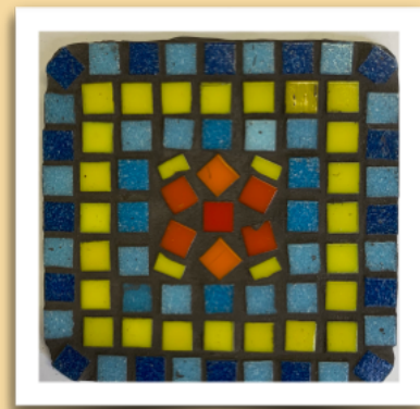
Examples of mosaic coasters made by children