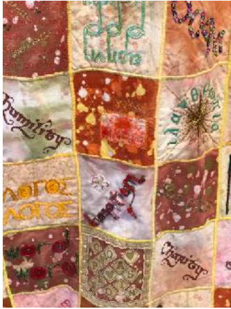
Westhill Endowment 'Holy Writ'

The idea of a Kindness Quilt is based on the ancient art of patchwork which dates back more than 5000 years to early age China and Egypt.