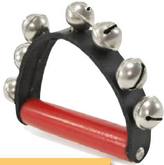
Hand-held Sleigh Bells

Why are these sometimes known as 'jingle bells'?