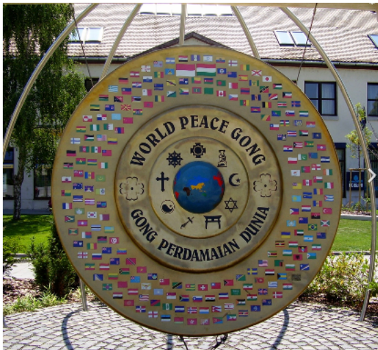
World Peace Gong-Hungary.

It is believed that gongs were invented in China in the 6th century.