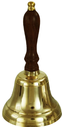
A hand bell.