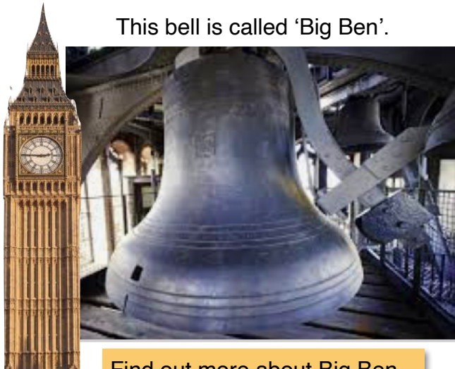
This bell is called 'Big Ben'.

A bell is hollow with a flared mouth. It is struck with a clapper which hangs freely and strikes the inside edge of the bell when the bell is swung.