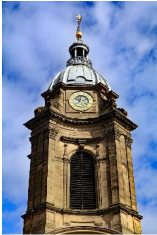
Bell tower, Birmingham Cathedral