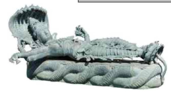
Vishnu - God who preserves the universe, lying on a seven headed serpent, with Brahma - God as creator.

The deities use mythological creatures, animals and birds as vehicles called vahana on which to travel.