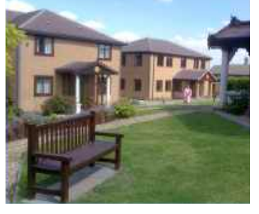
Monastery and Dr Rewata Dhamma Academy

The Dhamma Telaka Pagoda was opened in 1998. The design is based on a traditional pagoda (known as a stupa ) found in Myanmar (which used to be called Burma). This is shown in red on the map. The countries shown in yellow, orange and red are where Buddhism is the main religion.