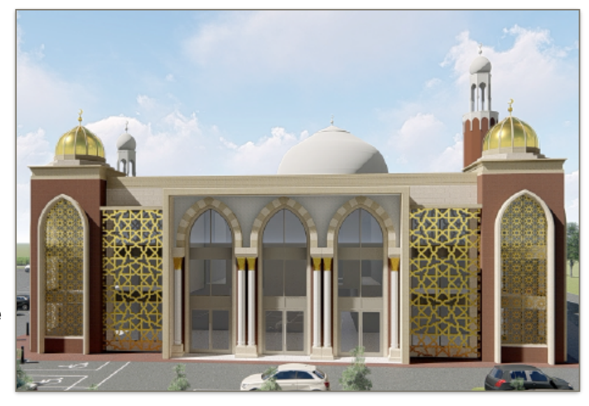
Birmingham Central Mosque extension project 2020-22 Taken from architect's video

The Muezzin (also Mu'addin in Arabic) calls the worshippers to the mosque reminding them to pray five times a day.