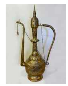
Islamic Arabic decorative jug