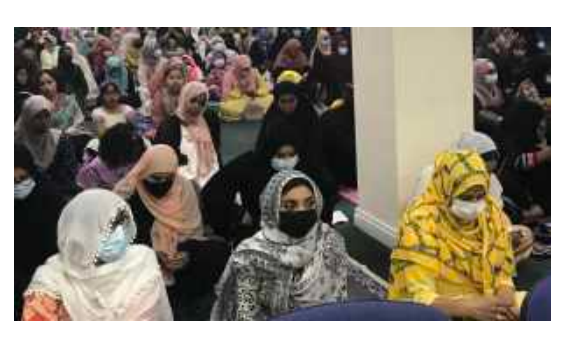
Women in their prayer hall at Eid ul-Adha 2021